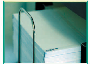
High capacity In-feed tray