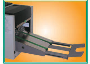
Optional automatic extending conveyor activated by the number of forms processed