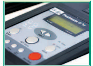
User friendly interface